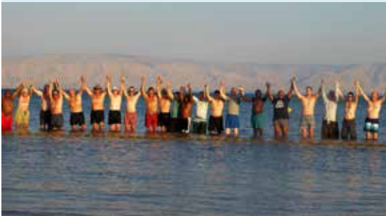
Polar Bear Swim in the Sea of Galilee